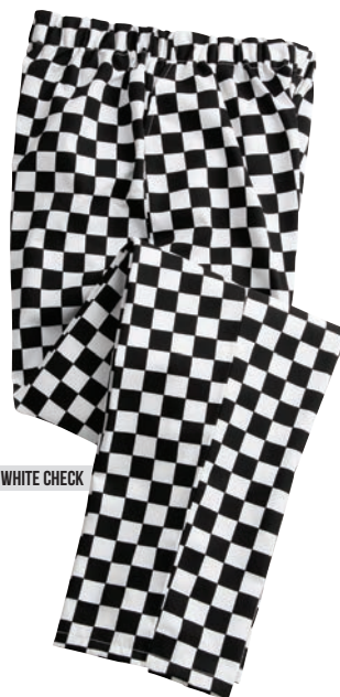
BLACK & WHITE CHECK

PR554 Chef's 'Select' Slim Leg Trousers ■ Fitted style on lower leg, Patch pocket on right leg, Elasticated waist with draw cord and zip fly fastening ■ 65% Polyester, 35% Cotton, 195gsm ■ Sizes: XS/28" – 2XL/44" ■ 1 colour