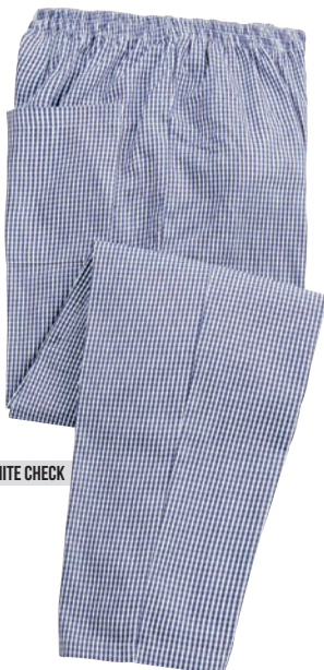
NAVY & WHITE CHECK