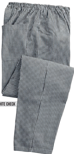
BLACK & WHITE CHECK