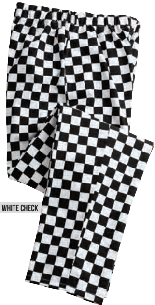
BLACK & WHITE CHECK

PR554 Chef's 'Select' Slim Leg Trousers ■ Fitted style on lower leg, Patch pocket on right leg, Elasticated waist with draw cord and zip fly fastening ■ 65% Polyester, 35% Cotton, 195gsm ■ Sizes: XS/28" – 2XL/44" ■ 1 colour