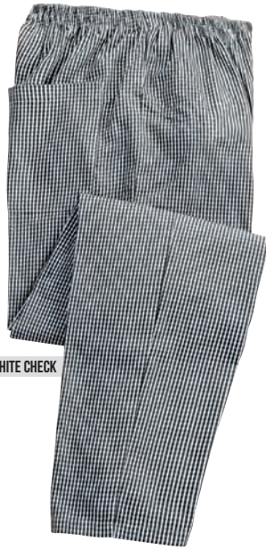
BLACK & WHITE CHECK