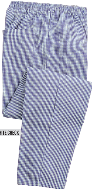
NAVY & WHITE CHECK